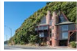
The Castle for accommodation