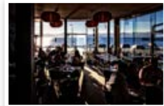
View from inside the Cobar Restaurant looking out at sunset over Days Bay